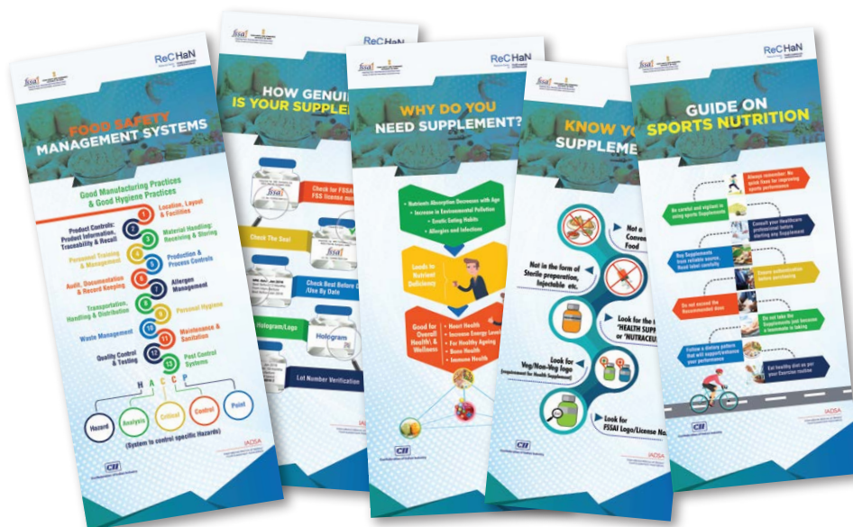
Posters developed on Health Supplements and Nutraceuticals

A consumer awareness programme was initiated on “ Know your Supplements ” during the Eat Right Mela, New Delhi. A Guidance Kit on consumer awareness was developed and distributed during the Eat Right campaign which includes information leaflet on Health Supplements & Nutraceuticals like what are Health Supplements & Nutraceuticals, basic information about identification and labelling of Supplements, difference between medicines and health supplements, how to check authenticity of supplements.