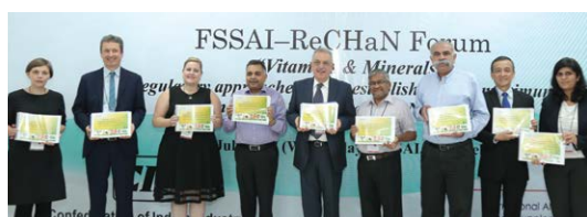
Release of FSMS training manual for Food Safety Supervisors Special Course